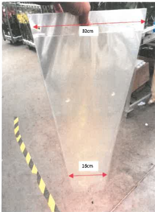
Example pack of the plastic sleeves

During the packaging process, plants can't get damages.