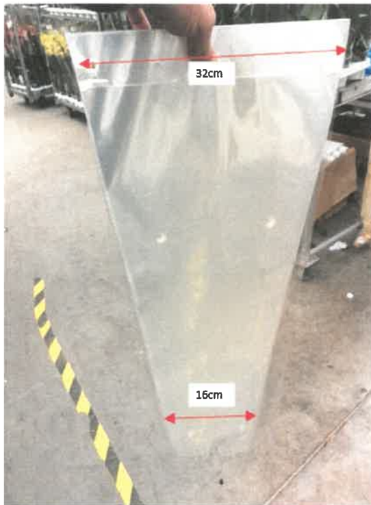
Example pack of the plastic sleeves

During the packaging process, plants can't get damages.